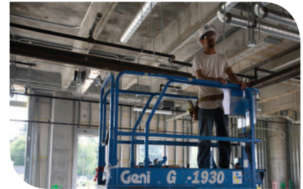
24/7 Lighting & Electrical Service