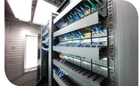
Quality Infrastructure Installation